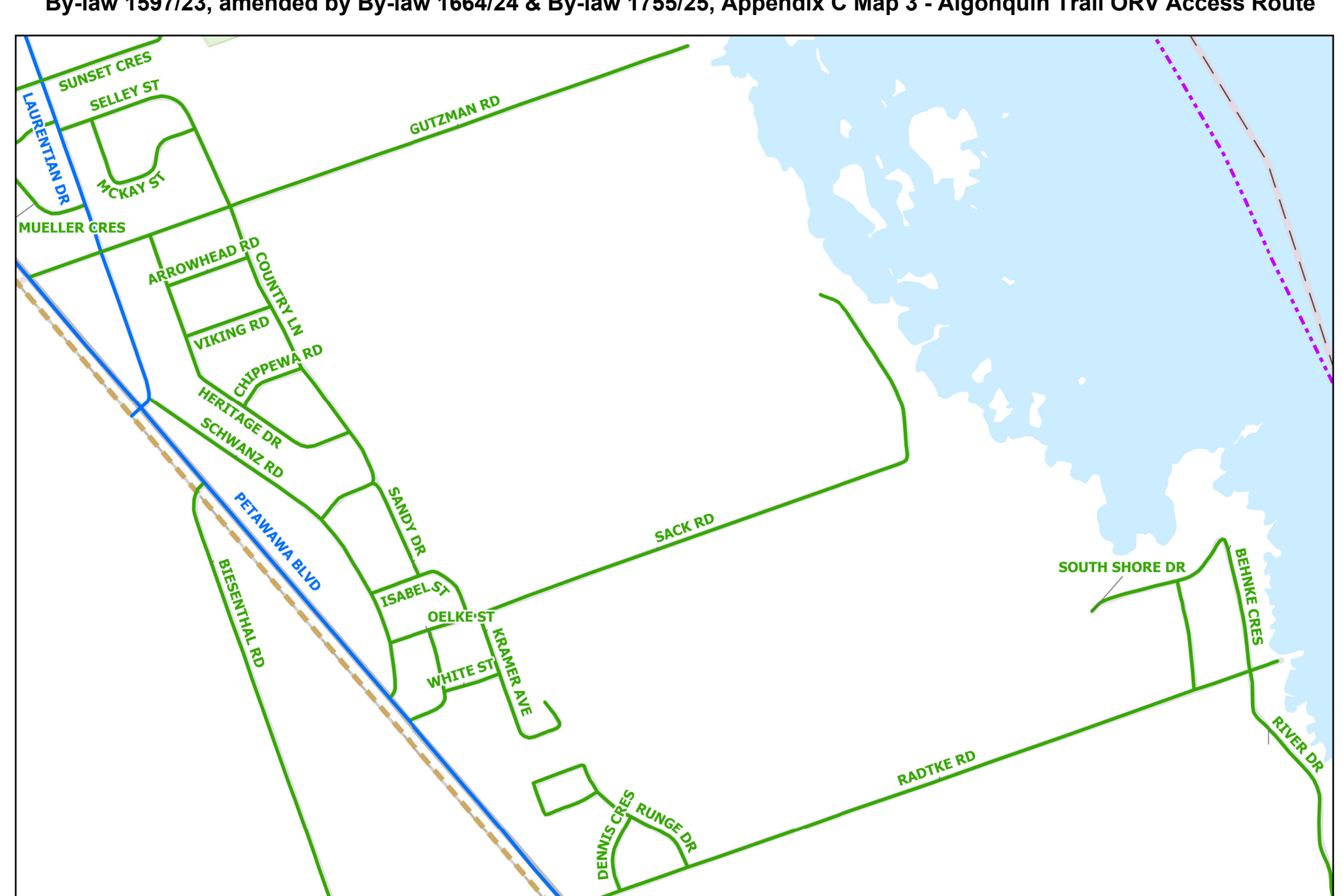
By-law 1597/23, amended by By-law 1664/24 & By-law 1755/25, Appendix C Map 3 - Algonquin Trail ORV Access Route