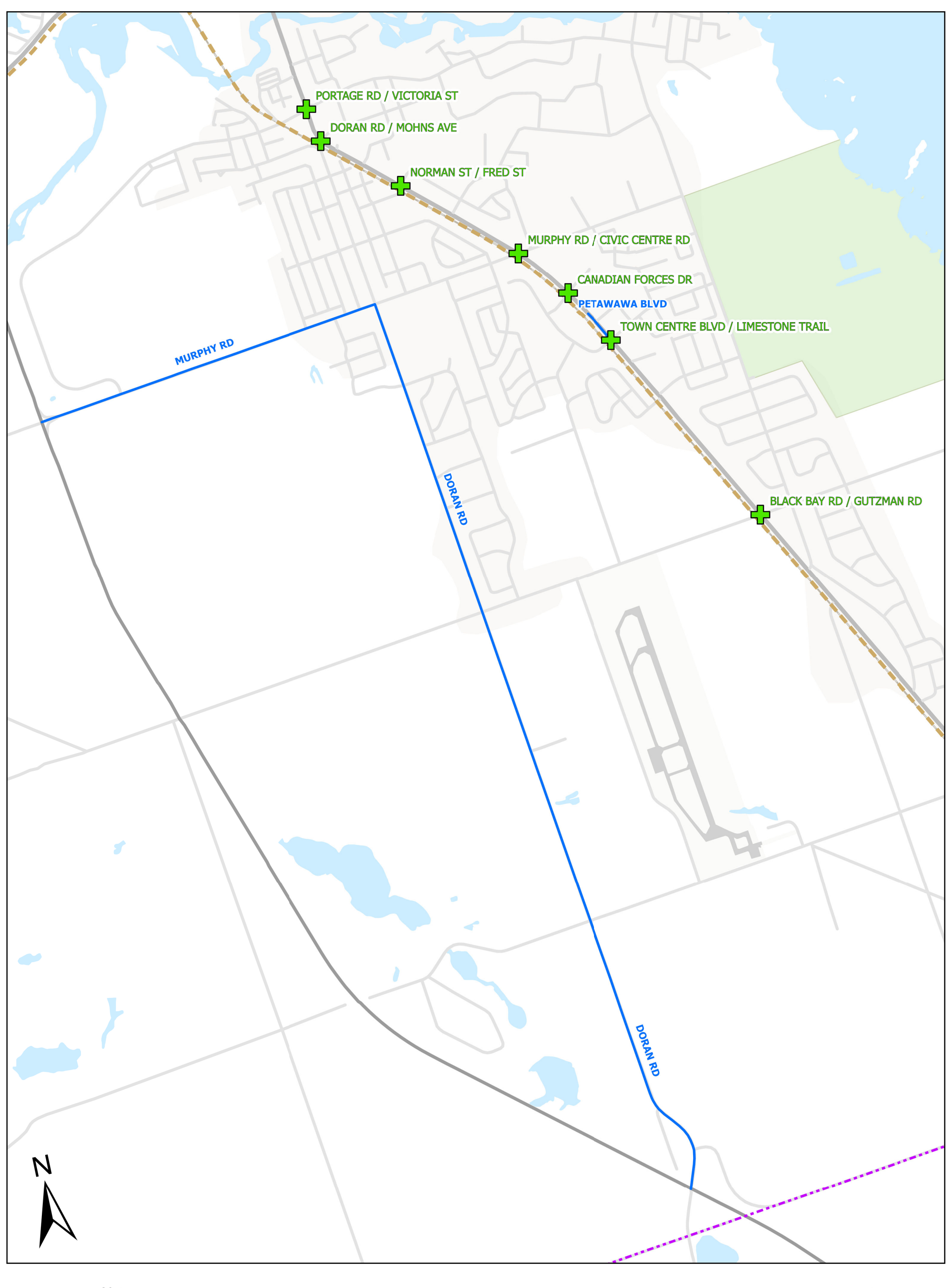
By-law 1597/23, amended by By-law 1755/25, Appendix B Map - County of Renfrew Designated Routes & Core Services Routes